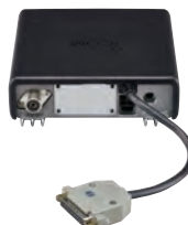
Optional OPC-2078 installation image